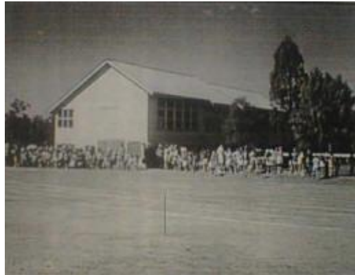
Sports Day, Injune State School about 1960. The blackboards on the side of the school were used to record team points.