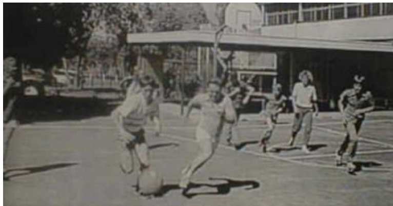
Students playing teachers basketball.

To get to school, I used to catch the Westgrove Road school bus every morning and afternoon, and will never forget that little green bus that transported us all to and from school along the corrugated, bumpy, dirt road. It's hard to believe it was the same bus that used to take my Dad to school. However, they tell me it used to be yellow back then!