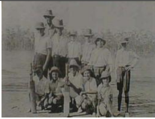
School Cricket Team 1935.