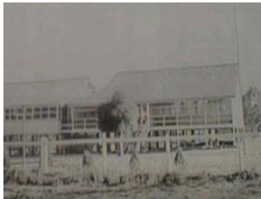
The Front of Injune State School about 1950. Note the bell in the left foreground and the flagpole in the right foreground.