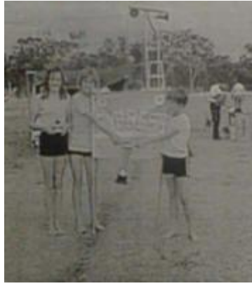
Sports Day 1975